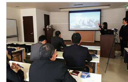
TASKS FROM COMPANY