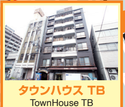
タウンハウス TB TownHouse TB