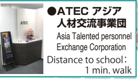
●ATEC アジア 人材交流事業団 Asia Talented personnel Exchange Corporation Distance to school: 1 min. walk