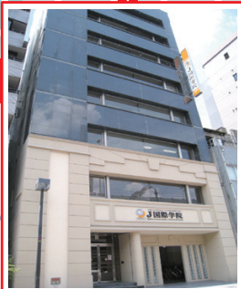
J国際学院 Japanese Communication International School