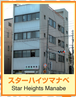
スターハイツマナベ Star Heights Manabe