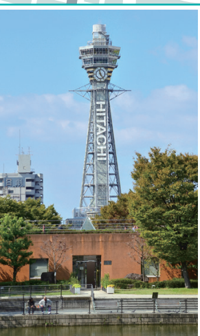
通天閣 Tsutenkaku Distance to school: 25 min. by bicycle