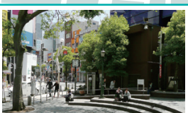
アメリカ村 Osaka America Village Distance to school: 6 min. by bicycle