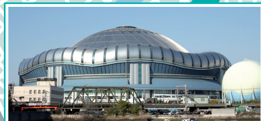
京セラドーム大阪 Kyocera Dome Osaka Distance to school: 20 min. by bicycle