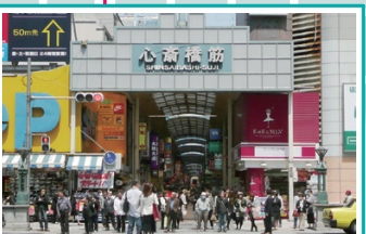
心斎橋筋 商店街 Shinsaibashi Shopping Street Distance to school: 3 min. by bicycle