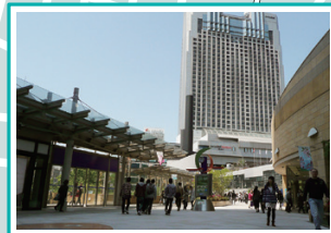
なんばパークス Namba Parks Distance to school: 15 min. by bicycle