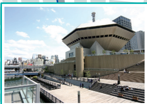
湊町リバープレイス Minato City Riverplace Distance to school: 10 min. by bicycle