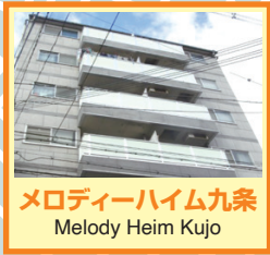
メロディーハイム九条 Melody Heim Kujo