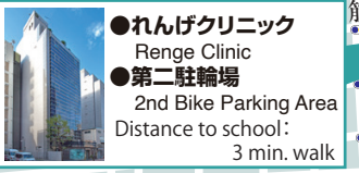
●れんげクリニック Renge Clinic ●第二駐輪場 2nd Bike Parking Area Distance to school: 3 min. walk