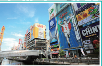
道頓堀 Dotonbori Distance to school: 10 min. by bicycle