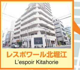
レスポワール北堀江 L'espoir Kitahorie